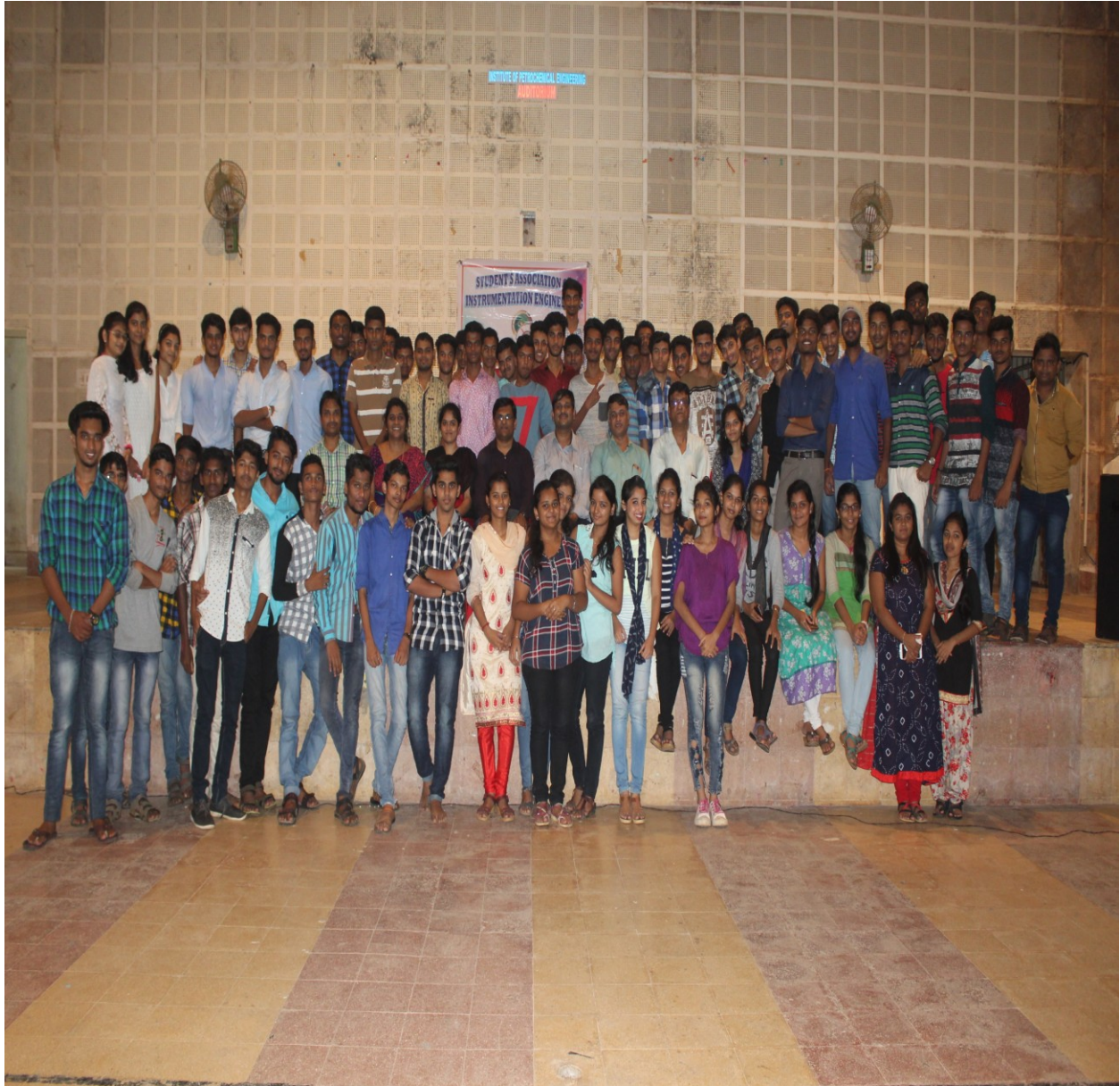
MATLAB & Proteus workshop